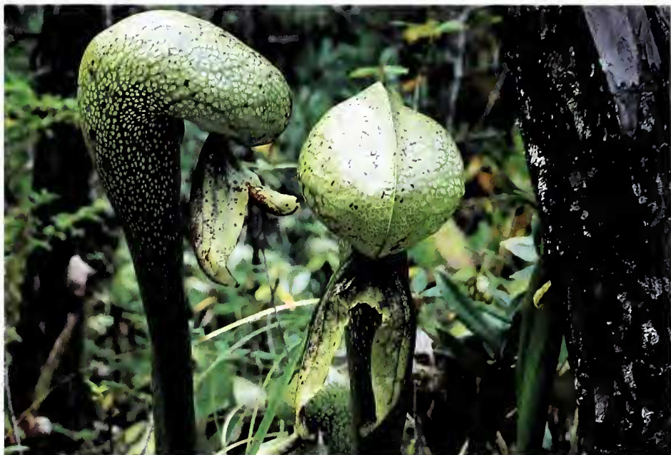
Figure 2: Darlingtonia : red-edge fang variant.